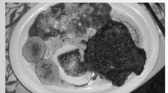
Filete de la Casa: A Tender Filet Topped with Chimichurri Sauce, Served with Potatoes, Soft Taco Ranchero and a Piece of Grilled Linares Cheese

"The quality of our food is what keeps customers coming back."