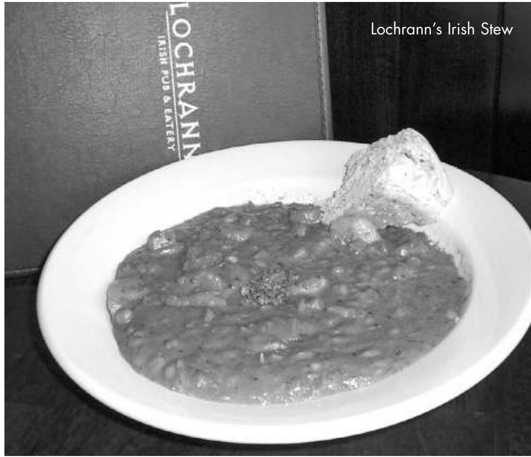
Lochrann's Irish Stew

Lochrann's Irish Stew 2 pounds stewing beef 3 tablespoons oil 2 tablespoons flour Salt and freshly ground black pepper Pinch of cayenne 2 large onions, coarsely chopped 1 garlic clove, crushed 2 tablespoons tomato puree, dissolved in 4 tablespoons water 1 1/4 cups Guinness 2 cups largely diced carrots